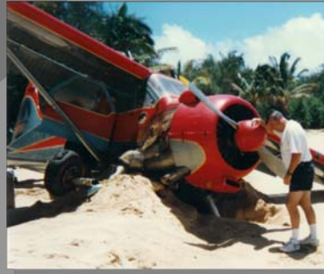
A Victim of Show Biz...