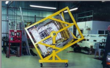
Fuselage jig on rotisserie for easier access