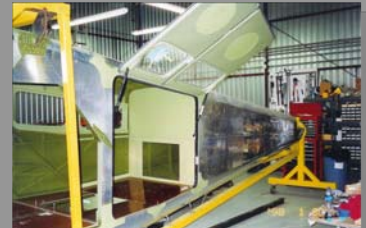
Fuselage mounted on jig with new skins and floors