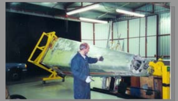
Stripping the old paint off the fuselage

Next up was the fuselage. Due to the extensive damage to the fuselage, a jig was built and attached to the fuselage at critical "hard points". The dimensions of the hard points were established from the original DHC-2 fabrication drawings. Extensive structural repairs were conducted, and 80% of the fuselage skins were replaced, requiring the installation of nearly 6,000 new rivets. The unique Beaver floors, constructed from phenolic with aluminum reinforcing members, were scratch built from original plans.