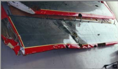
Wings as received